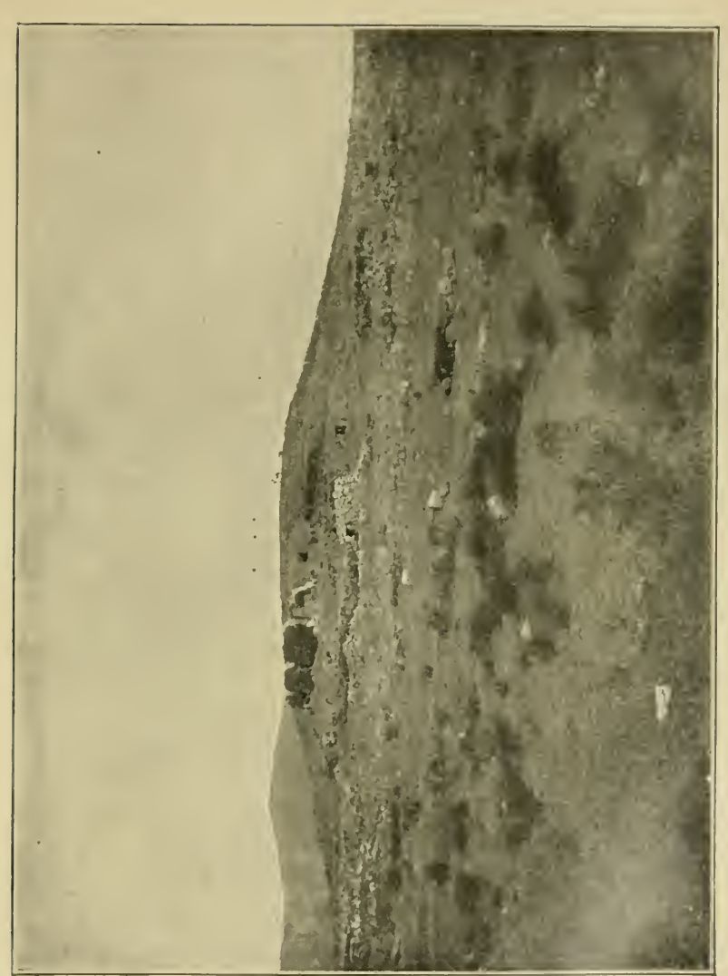
GUDELISSIN. MOUND MARKING THE SITE OF DERBE.